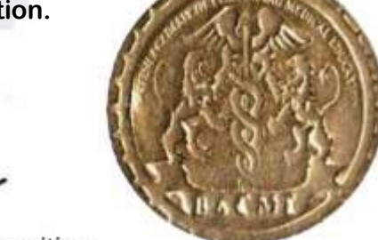
Chair, Committee for Review & Recognition