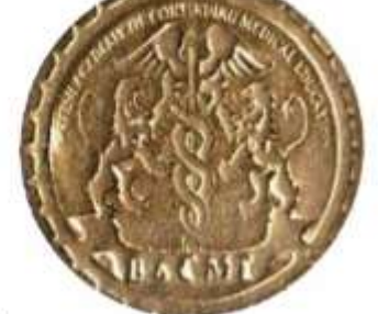
Chair, Committee for Review & Recognition