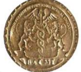
Chair, Committee for Review & Recognition