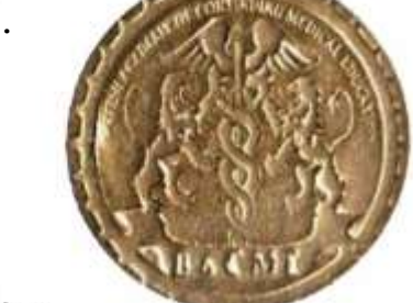
Chair, Committee for Review & Recognition