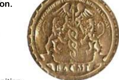
Chair, Committee for Review & Recognition